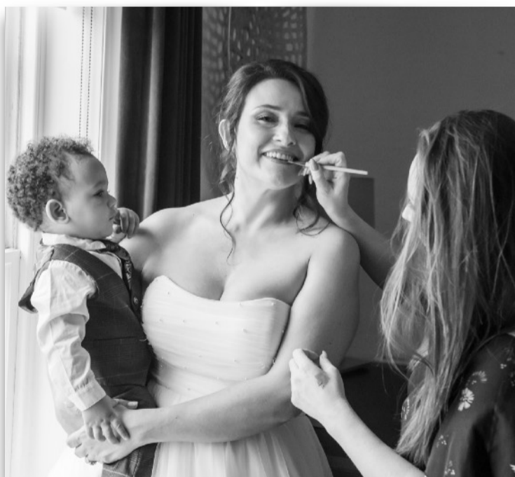
Bridal preparations at Lichfield

Not far from Burton, there are a number of bespoke wedding venues. Some of the venues I have worked at are Alrewas Hayes, Barton Marina, Dovecliff Hall, Hanbury, Hoar Cross Hall, Lichfield (Registry Office and Cotton House Farm) and Newborough. There are many examples in the wedding portfolio on my website if you would like to take a look. It has been hard selecting just a few images for this brochure! A lot of planning goes into preparing for your perfect wedding and the photos that will provide a lifetime of happy memories. We will arrange a rehearsal to visit the venues and take some trial photos. They are included free of charge. Why? Well its important to agree the backdrops for the wedding photos you'll treasure for a lifetime.