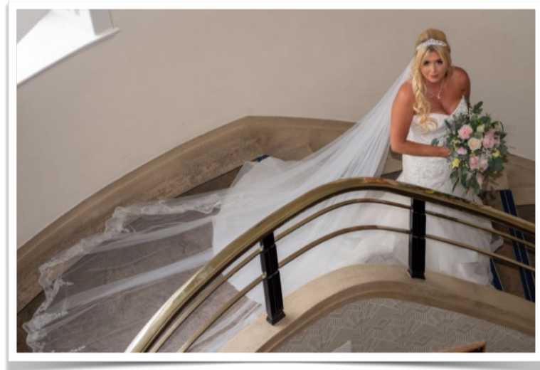
Ready for her wedding, at Derby Conference Centre

In the north, these include Makeney Hall, Shottle Hall, Cressbrook Hall and Alison House Hotel. I have also taken wedding photographs in Derby at West Mill, Darley Abbey, and the city centre registry office. Then in the south of Derbyshire, at Hartshorne, Linton, Melbourne, Newhall, Newton Solney, Rosliston (Forestry Centre and Hidden Hive), Swadlincote (Church and Town Hall), Ticknall and Weston on Trent.