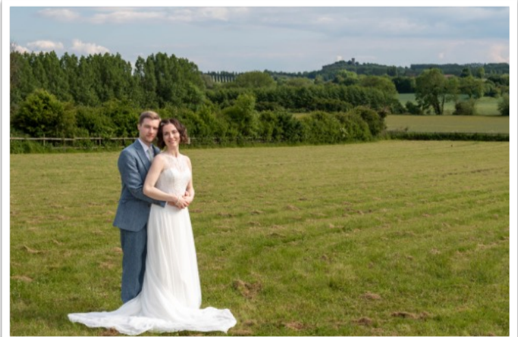
In the grounds at Melbourne View, South Derbyshire