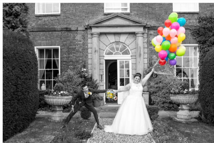
Dovecliff Hall in Rolleston-on-Dove, Staffordshire. This part colour image is based on the film 'Up'.