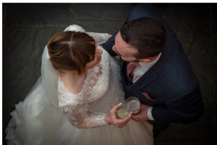
At Cressbrook Hall, Derbyshire

In the north, these include Makeney Hall, Shottle Hall, Cressbrook Hall and Alison House Hotel. I have also taken wedding photographs in Derby at West Mill, Darley Abbey, and the city centre registry office. Then in the south of Derbyshire, at Hartshorne, Linton, Melbourne, Newhall, Newton Solney, Rosliston (Forestry Centre and Hidden Hive), Swadlincote (Church and Town Hall), Ticknall and Weston on Trent.